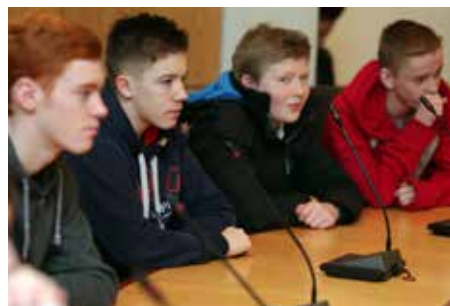
Some of the young people from the IEP at an event in Antrim.

It offers a range of practical employment-related training courses and aims to help tackle big social issues such as anti-social behaviour, drug abuse and inter-