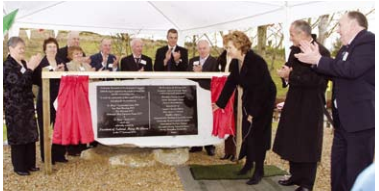
President McAleese is pictured performing the official opening ceremony of a number of projects in Lisdoonan, Carrickmacross.